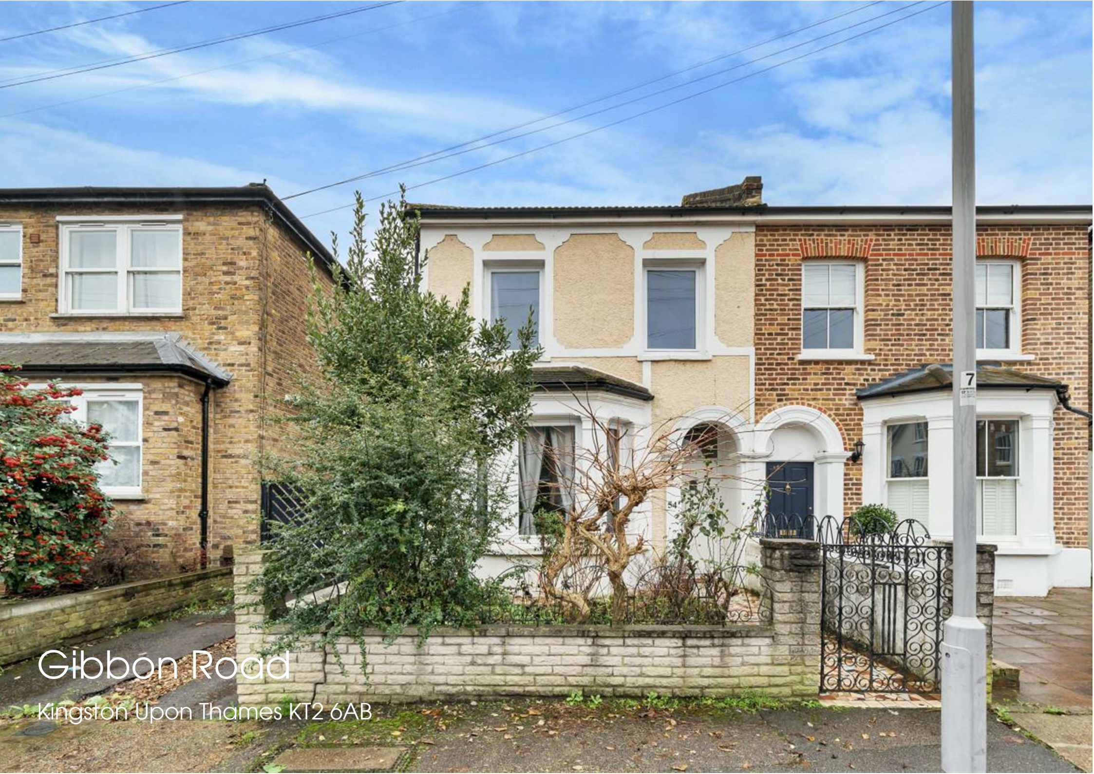
Gibbon Road Kingston upon Thames KT2 6AB